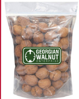
Georgian Walnut Enterprise's packaged walnuts

Although Georgia has traditionally been a net importer of walnuts, the support provided by the Program has allowed the country to realize self-sufficiency and import substitution for walnuts. While the local market still relies on low-quality imported walnuts, the export potential of high-quality Georgian walnuts is on the rise. This upward trend, coupled with the Program's efforts to help producers meet internationally mandated quality standards, is contributing effectively to the vitality and growth of Georgia's walnut industry.