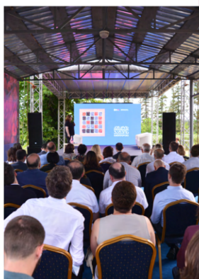
Georgia's first-ever Berry Forum (2021)

As a result of these activities, the Georgian blueberry sector has grown tremendously in terms of capacity, quality and scale. At the same time, it has been reinforced by a strong supply chain and improved relationships with key