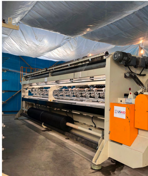
Agrobade Ltd's anti-hail net facility and orchards