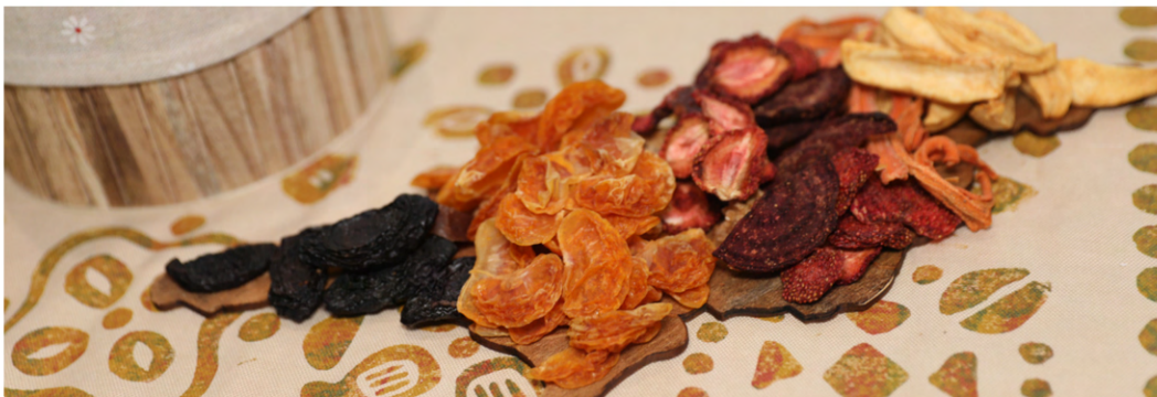
Georgian tea plantation, strawberry field and dried fruit display.