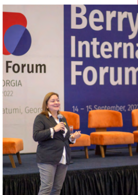
Georgia's second annual Berry Forum (2022)