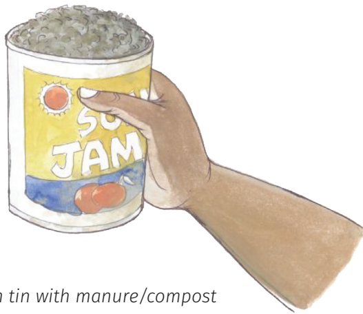
Heaped 500g jam tin with manure/compost

1 Use a 500g old jam tin of manure per planting station.