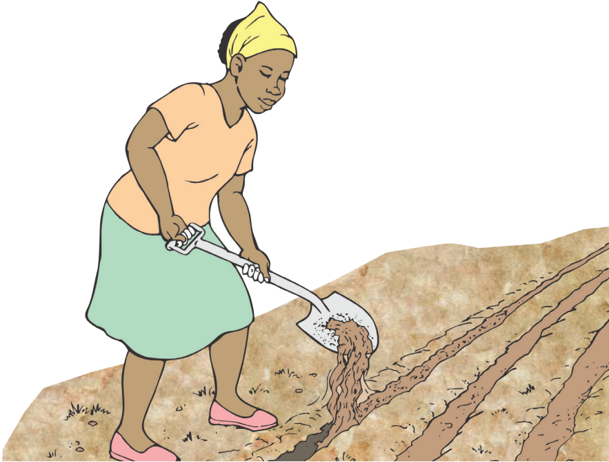
Cover manure/compost with a thin layer of soil.

3 Cover manure/compost with a thin layer of soil as shown below: