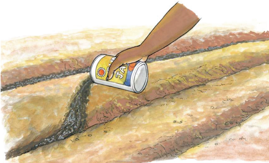
Blend manure/compost in planting lines.

4 Manure/ compost can also be bended in planting lines as shown below.